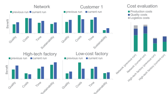
Fig. 5. Evaluation of quality control strategies

In a last step, a module to systematically evaluate the benefit of potential quality measures against the necessary effort for implementation for each location as well as for the entire production network is presented. For each site, the simulation model provides performance indicators in the defined target dimensions. The number of scrapped parts, reworked parts, as well as the number of inspected parts determine the quality dimension. The dimensions costs and time can be separated in three sections: production process related, quality related and logistics related indicators. The minimum volume flexibility of the location is taken into consideration for the dimension flexibility. The market proximity is determined by evaluating the distance from the site to the location of the next customer. Process knowledge is evaluated using the Overall Equipment Effectiveness (OEE), while sustainability is depending on the level of waste per unit. Finally, the dimension of product innovations is assessed by the amount of new products per time period. From these indicators, the simulation model calculates the benefit of a quality measure in the single dimensions, which are of individual importance to a specific site according to its role. Figure 5 shows a potential visualization of the implementation of a quality control measure for different sites and the network in the exemplary target dimensions quality, time, costs and sustainability.