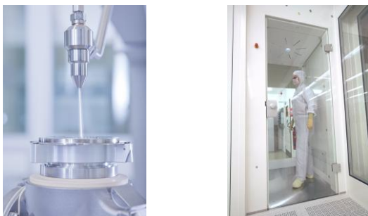
Figure 4. CO 2 snow cleaning as ultraprecision cleaning technology (left) used in the precision cleaning cleanroom at ESTEC (right).

applications because it can remove particulate (biotic and abiotic) and molecular (organic) contamination at the same time very effectively. With the described approach, it could be proven that CO 2 snow cleaning is a suitable ultraprecision cleaning technology for space flight because it fulfils the high requirements of the planetary protection policy (Figure 4). Also other cleaning technologies can be validated with this approach to make the cleaning efficacies of different cleaning technologies comparable for the first time. Of course, such concepts can be also transferred to validate the efficacies of cleaning technologies relevant for other branches like semiconductor, pharmaceutical or medical device industry.