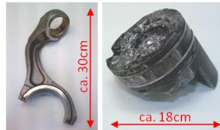
Figure 5. Damaged connection rod (left) and cylinder (right). Failure reason was a continuous gas injection caused by a micrometre sized particle.

During the last ten years, the following quality problems could be observed: residual particulate contamination, mainly metallic particles >50µm, caused various functional impairments, e.g. in many fluid circuits found in automobiles (fuel systems, brake circuits, lubricating and hydraulics systems, cooling and air-conditioning systems, air intakes or exhaust systems and further treatment, etc.) as well as in mechanical and electronic units. Even very small amounts can cause severe problems (Figure 5).