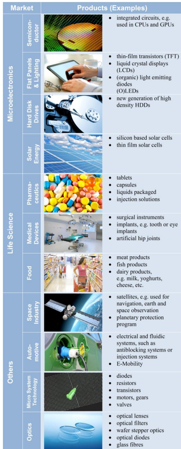
Figure 1. Overview of markets (incl. exemplarily shown products) relying on cleanliness technology.

daily increasing and highly diversified application fields of cleanliness technology. In this understanding, cleanliness technology means the chain of all activities taken to control and reduce contamination harmful to the product as well as human health (Gail et al 2012).