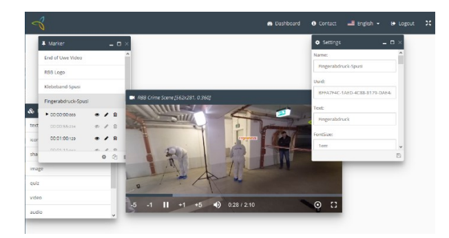
Figure 2: Tool for HbbTV interactivity editing

As switching between these videos, for example from a horizontal view of 30^{\circ} to 60^{\circ} would introduce a visually irritating jump, additional videos are rendered that show a 'pan' of the virtual camera between these fixed views. The length of such a 'pan' can be freely defined, but is in most cases a half or a full second. [9]