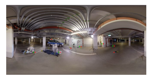
Figure 5: "Crime scene" placement of interactive elements

The initial setting is an underground car park where a corpse was found. The police were notified and are performing their investigation. Viewers can look around and interact with the people and some of the objects. Green dots denote links to 360° videos, red dots are links to fixed-perspective videos and yellow rectangles are links to images.