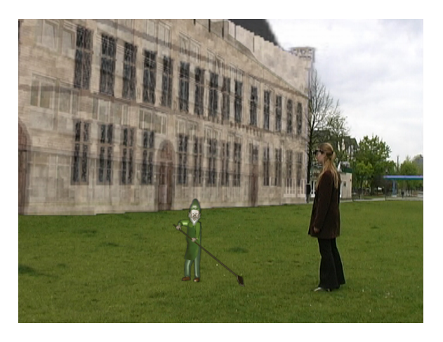
Figure 1: User wearing AR system in front of historic building.

The game story is built upon the legend of the Heinzelmännchen of Köln, which are little elves. A player is equipped with a "brandnew top-secret" technology that allows him to travel in time using portals and to see the Heinzelmännchen. Each Heinzelmännchen is part of a small challenge, that imparts knowledge about the city and its history.