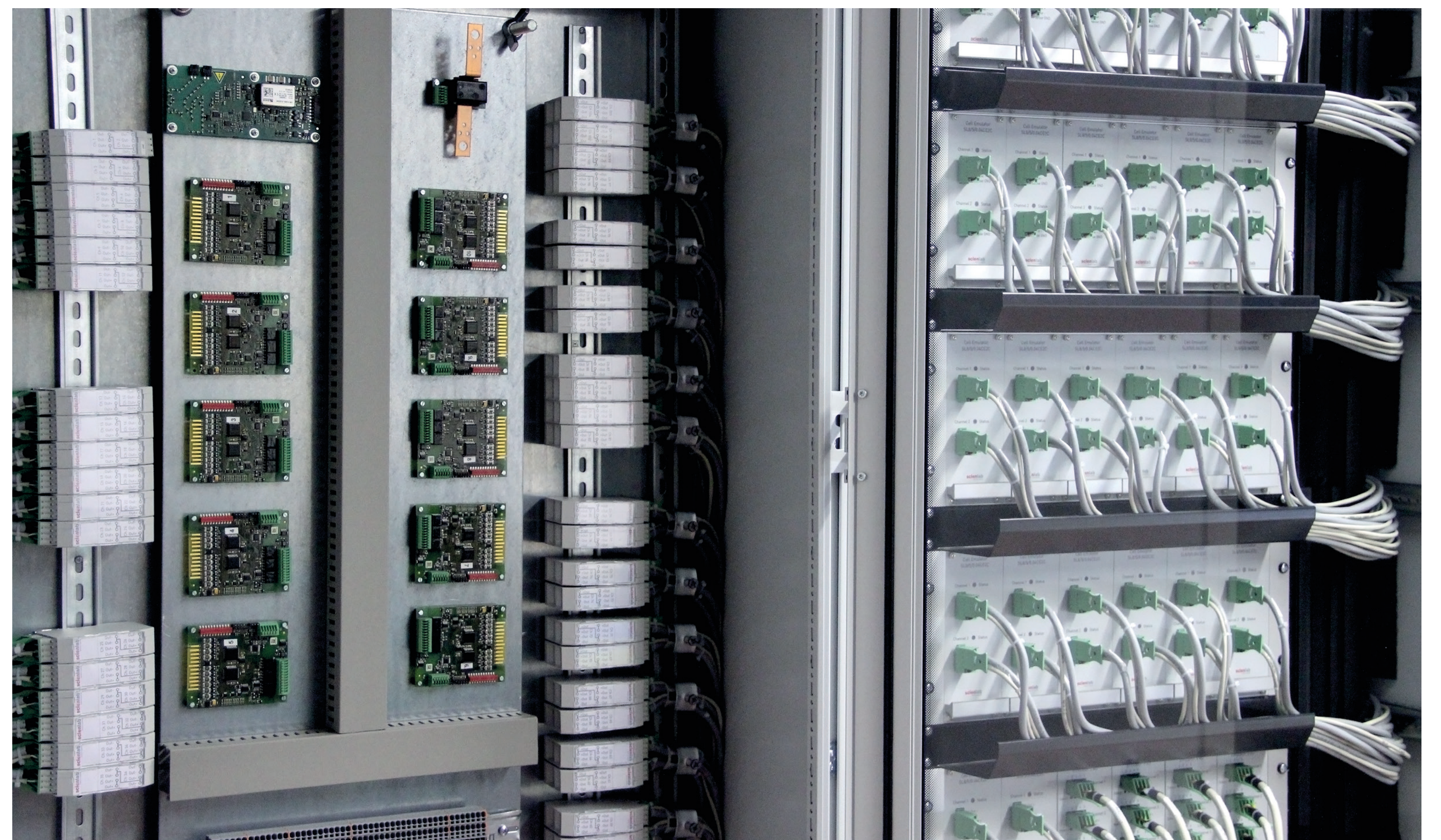
Fig: BMS-Slaves under test in the BMS-HIL at the Fraunhofer IWES

Thus emulator-based HIL environments accelerate the development and testing of a BMS since the conditions can be changed by software. Safety issues are avoided completely. In contrast to a real LIB, it can provide internal battery quantities, thus delivering a reference value for the BMS algorithms.