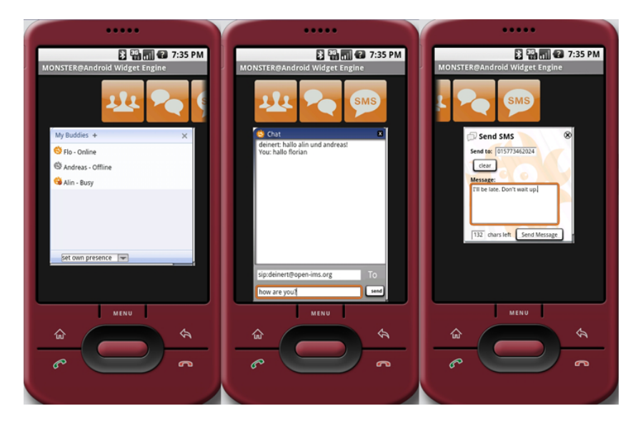
Fig. 4. Widget Engine on Android Emulator

The same widgets deployed on the desktop widget engine will also run on Android. This enables rapid development of Android IMS applications without knowing anything about Java or the Android code model. Only some lines of HTML and JavaScript must be written to create an IMS application on Android.