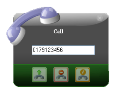
Fig. 2. Call Widget

Figure 2 shows an example call widget. When inserting a number or SIP address into the input field and clicking the green button on the left a new connection will be established. Another use case appears when an incoming call arrives and the user clicks on the green button. In this case the incoming call will be answered, instead of initiating a new call. The user has the power to cancel the call or see viewing information about the call by pushing the buttons on the bottom of the widget.