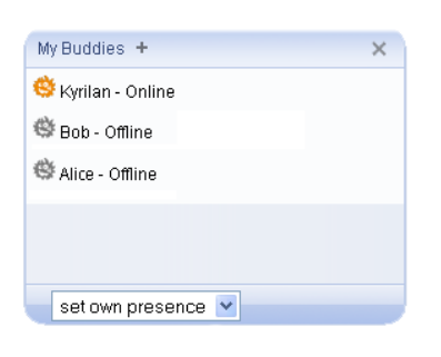
Fig. 3. Address Book / Presence Widget

Each widget may contain an init function, which can be written by the developer. This function is executed after the widget has finished loading. The init function is meant to define what happens when incoming events, like an incoming call for instance, occur. The following code demonstrates the simplicity of the API. In the init function of the example call widget a callback function is defined which is invoked when an incoming call arrives. The callback function starts to play a ring tone and sets the global JavaScript variable status to "Incoming". The lower 4 lines handle the call status inside of JavaScript. onConnectionStatusChange subscribes this widget for notifications of call connection status changes. If the status changes it is displayed above the input field.