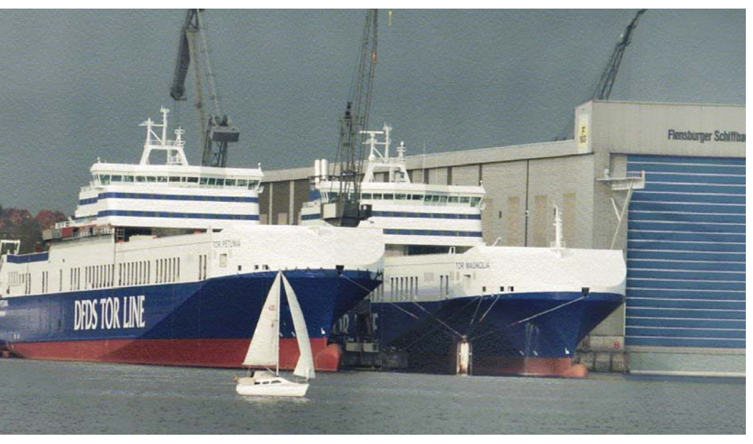
Figure 2: RoRo ferries by Flensburger Schiffbau Gesellschaft.

depending on the distance between partners and their security needs. Remote Method Invocation (RMI) realises communication in the same