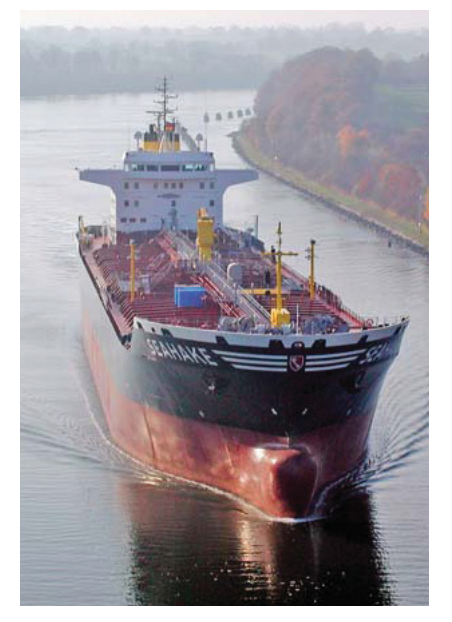
Figure 3: Double hull tanker by Lindenau Werft.