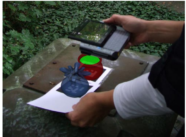
Figure 3. The Alchemists: A player puts an ingredient from the bag into the cauldron by using the basic interaction of the Magic Lens Box.

Especially the scoring process demanded that you could attach a rule to several game objects at the same time, something we had overlooked in the first design process for the Magic Lens Box and quickly implemented. It also proved very useful that instead of having to specify a concrete game object or property inside a condition or action of a rule , you could always instead automatically use the game object or property that invoked the rule .