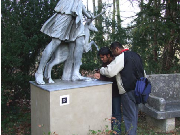
Figure 5. The Treasure: Two players getting a new quest from a statue.

At this point we gave them an overview of the Magic Lens Box, and let them ponder about the best way to implement their game. In the beginning the students had some problems understanding the difference between mobile and stationary containers . After getting examples, however, on how to use them best, the students quickly noticed that all the characters in the game (real statues) were best represented by stationary containers , while the items the players would have to use for solving the riddles became mobile containers (as these would be carried around by the players).