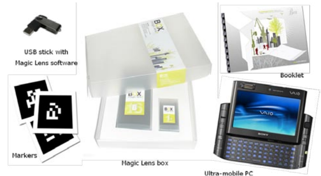
Figure 1. The Magic Lens Box (center) and its content (left and right)

Our two main objectives are somehow contradictory, since supporting a high flexibility in the design makes a system rather more complex and does not simplify it. To achieve the objectives stated above we had to cut down and limit certain aspects. During the iterative design we decided on a certain MR hardware system as well as on a certain set of interaction techniques that are the same for all the games based on the Magic Lens Box.