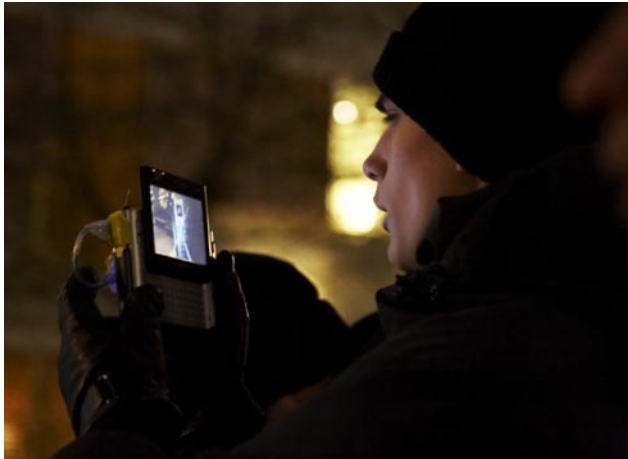
Figure 4. Interference: A player using the UMPC to map out the virtual network.

Additionally the sleek design of the UMPCs was seen as really fitting the setting of the initial game scenes. In some groups mapping out the network became a group effort with different players stating their opinion on where to go next, while in other groups one person with good orientation skills took the lead.