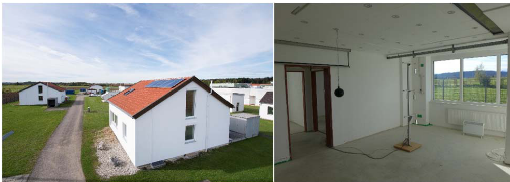
Fig. 1. (a) external view; (b) internal view of living room.

To be used for side-by-side experiments it is necessary to show that the two houses are essentially identical. They have exactly the same dimensions, room layouts and constructions. Pressurization tests were carried out on the two buildings showing less than 5% difference, within the normal test accuracy of the EN 13829 Standard. A four-day heating test was also carried out with the houses in an identical configuration with the same setpoints: this showed total heating energy consumption of both buildings was within 0.5 %.